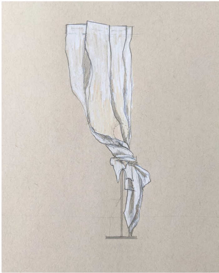
Early sketch of TOILE Helen Levitt. Walker Evans seated at breakfast table, NYC. c. 1940 Michelle Lamy in Comme Des Garçons Lynda Benglis in her Bowery studio, c. 1981.